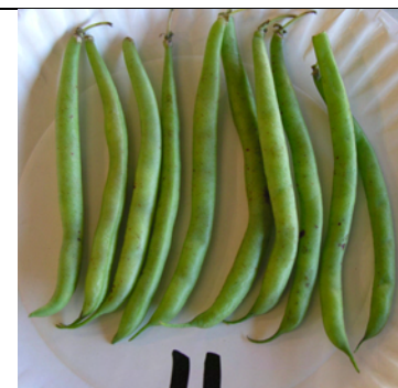
Snap Beans: 3-4-2-1; cuts of 1, 3, 6