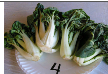
Chinese Cabbage [Bok Choy]: 3-4-1-2; cuts of 2, 5, 3